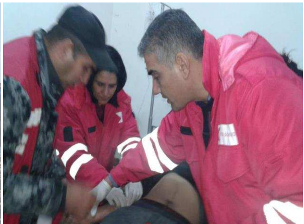
Cilbirê village / 28 January 2018