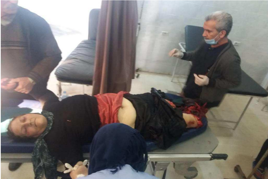
A mother in the Rajo area lost her legs on January 30, 2018 due to a Turkish air strik. She was transported to Avrîn Hospital.