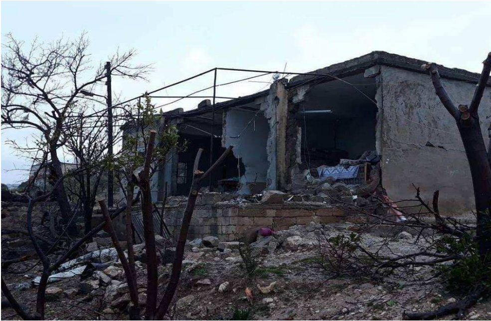
Destruction of civilian houses in Jinderes town in Efrin suburbs / 24 January 2018