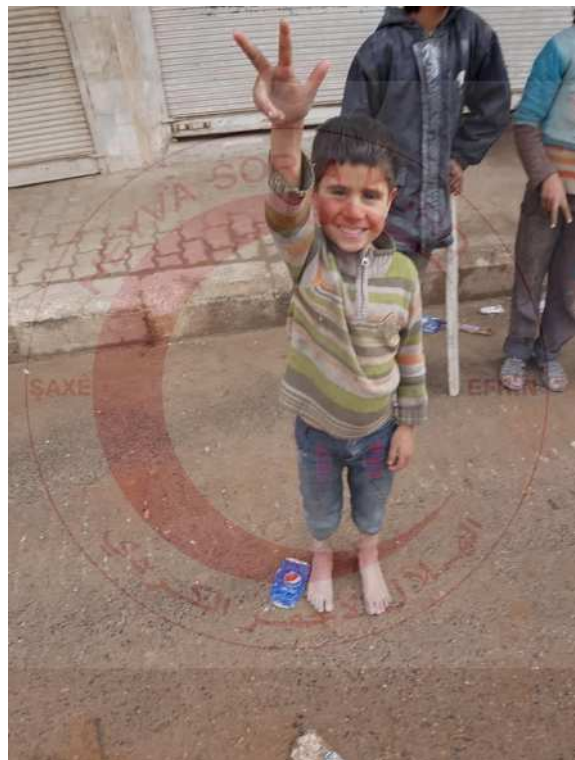
Civilians live in Basements and Caves in the Jinderes district area in Efrin, they are suffering of lack of water, food, electricity and basic health services Cindirêse - Hemame Village - 27 Jan 2018