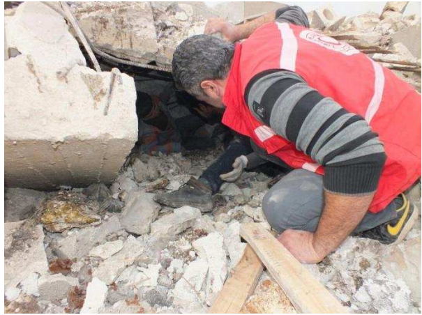
Photo showing Kurdish Red Crescent rescue teams trying to evacuate a child stuck under wreckage after warplanes attacked a poultry farm near the village of Anabke in Efrîn suburbs where IDPs were taking shelter, this attack led to many deaths amongst civilians / 21 January 2018