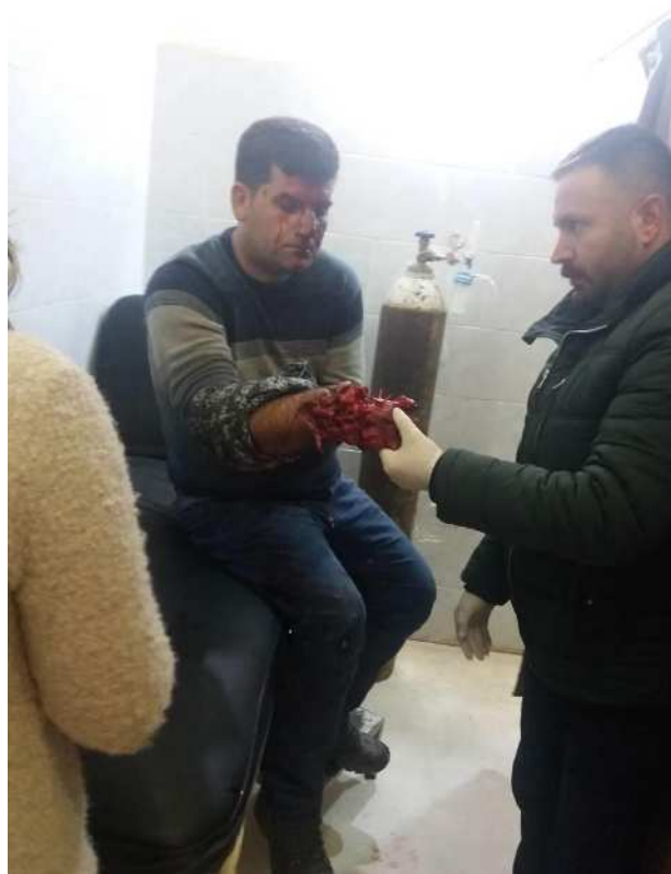
Civilian who was evacuating his family after being he treated his uncle in (Rajo) in KRC Casualty colectiv point. During transporting the familly to Efrin Hosputal, their car was targeted and as a reasult he lost his are, the auncle and his wife lost their legs .